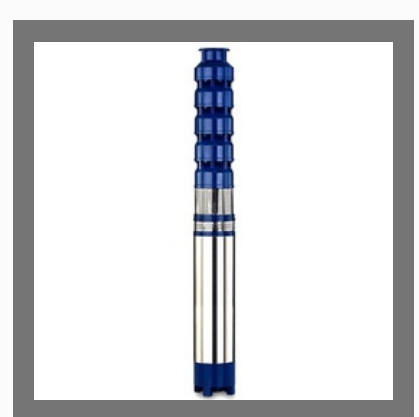
V9 Submersible Pump