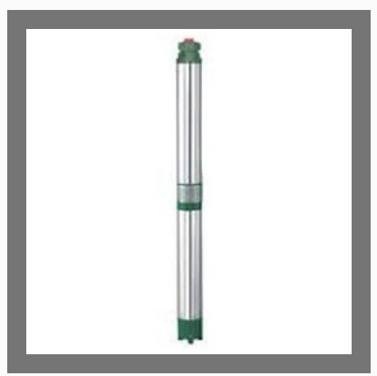
V3 Submersible Pumps