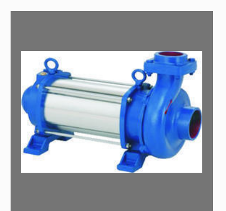
Mini Openwell Pump