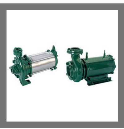
Horizontal Open Well Pumps