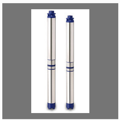
Borewell Water Pump