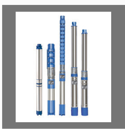
Borewell Submersible Pump