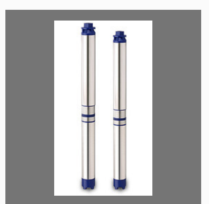
Electric Submersible Pumps