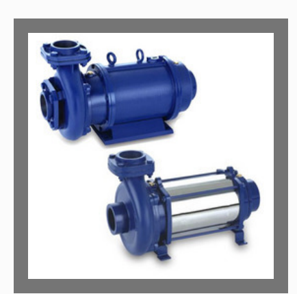
Openwell Submersible Pumps