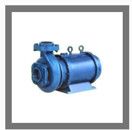
Open Well Pumps