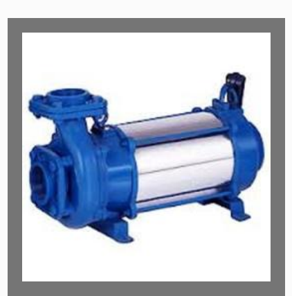
Mini Open Well Submersible Pumps