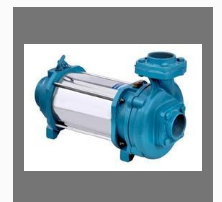
Sumbersible Openwell Pump