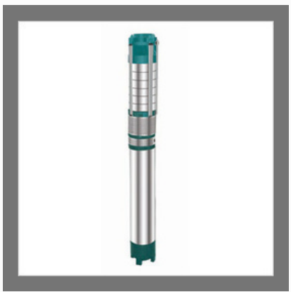
V6 Submersible Pumps