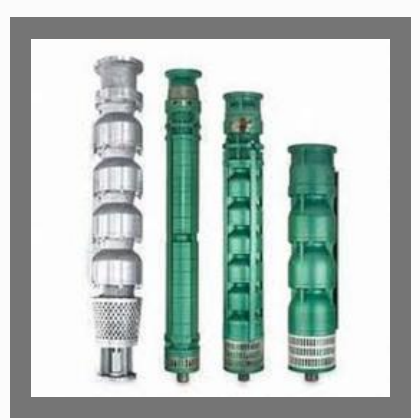
Deep Well Submersible Pumps