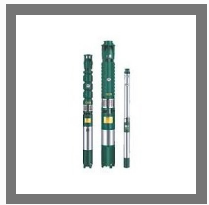
Industrial Borewell Pump